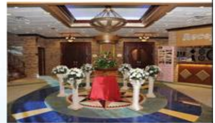
Each Best Western® branded hotel is independently owned and operated.