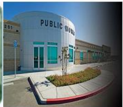
Build with Confidence

CERTIFIED : MBE (NYCSBA – NYCSCA – NY State – Port Authority – NYC Transit)