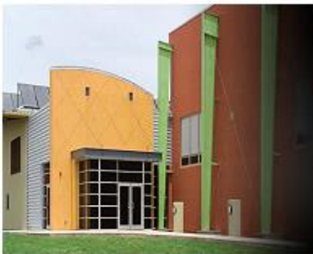
Build with Innovation